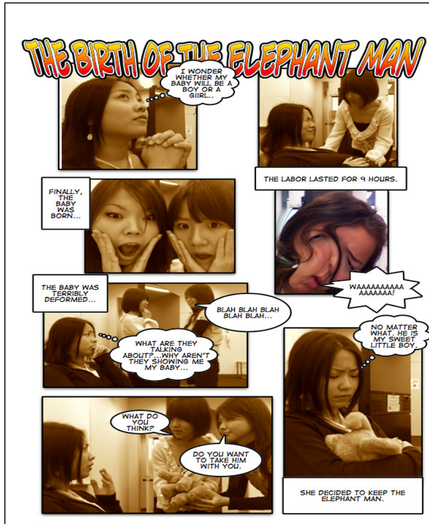
Figure 21# Birth of the Elephant Man

Figure 21# shows how one student group created a new scene from the Elephant Man's life.