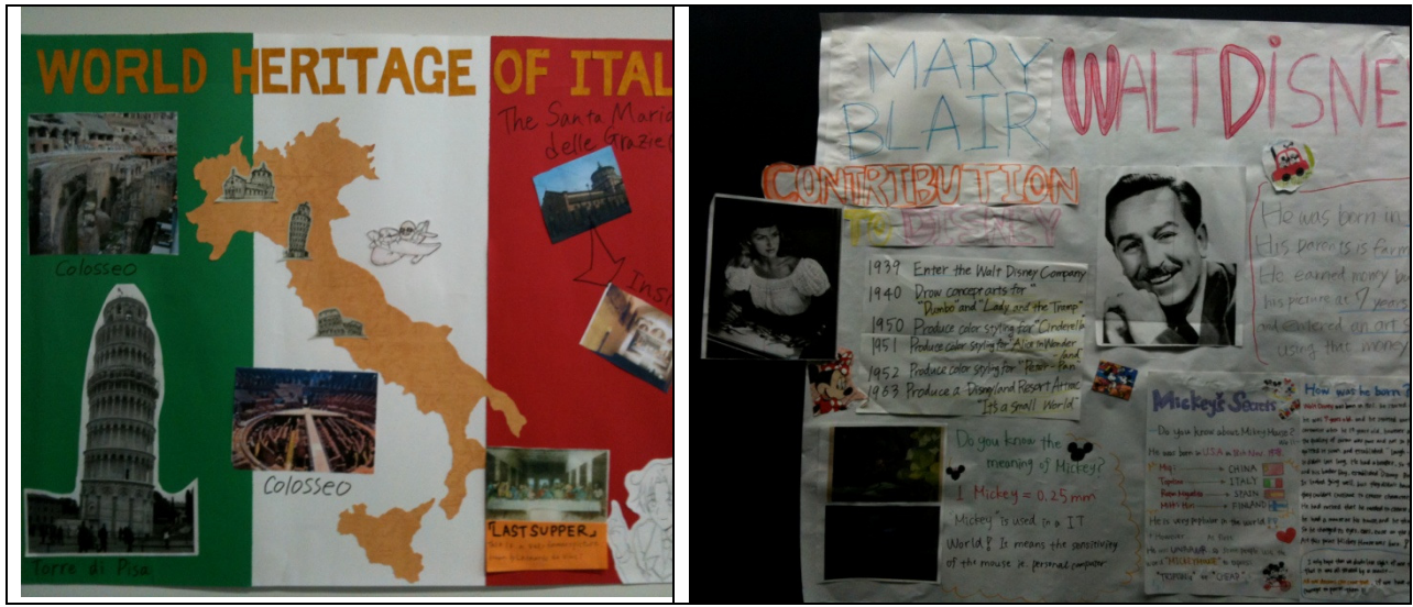
Figure 18# Poster for Geography and Biography: Italy and Walt Disney