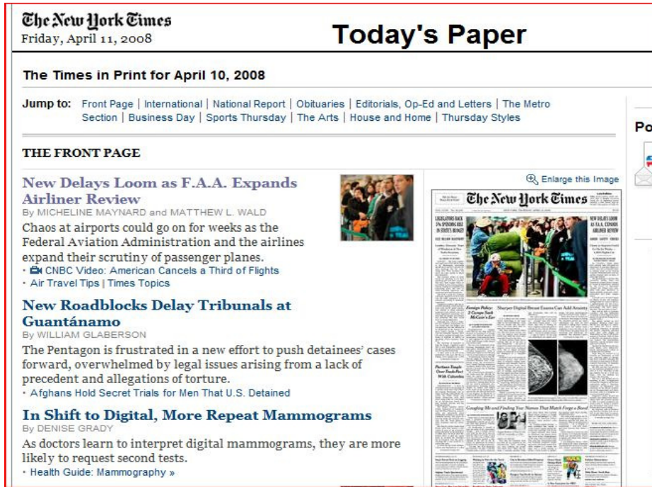
Figure 9# Screenshot of The New York Times website